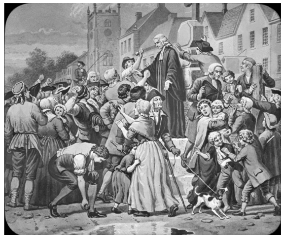
John Wesley Preaching on a Village Street