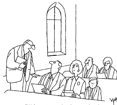
"Welcome to our church—even though you're sitting in our family pew . . ."