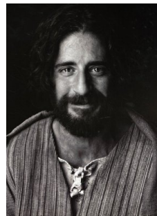
Photo of Jonathan Roumie, the actor who is Jesus in The Chosen .